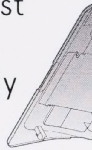
Transmission (Samsung SL-M2020, SEC8425199908AC), 2020, 29,7x21cm, Laserjet and pencil on PlanoArt hochfein, holzfrei 90g